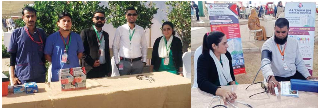
Altamash General Hospital recently organized a Free Medical Camp at Behbud Open House. Medical Check-ups along with basic lab tests were also conducted free of charge.